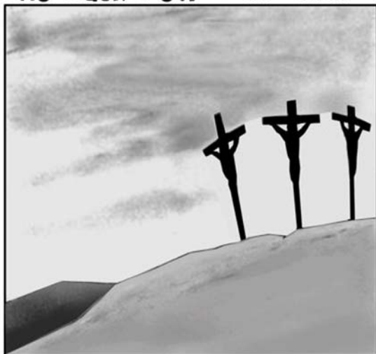
GOLGOTHA - The hill of redemption where Christ shed his blood for our sins. Mt 27:33

On Easter Sunday we will gather to celebrate the power of God. We will proclaim that God has defeated death and the devil forever. Our God reigns!